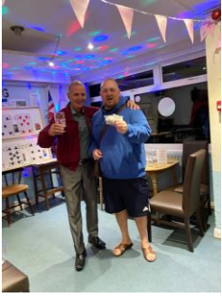
Rocky took an early win of £56.00.