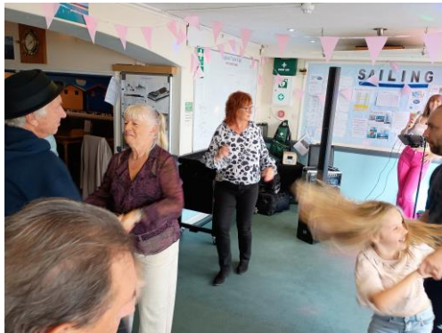
A good time had by all.